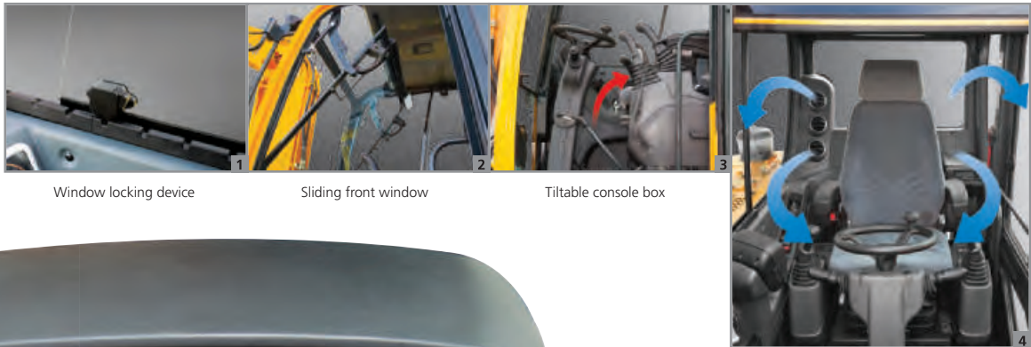
Window locking device