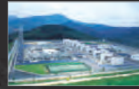
Electro Electric Systems Division