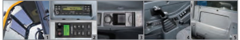
Roll-up Sun visor Radio / MP3-player with remote control Hands-free cell phone Ergonomic joysticks Storage compartments