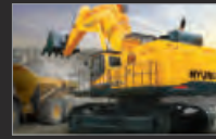
Construction Equipment Division